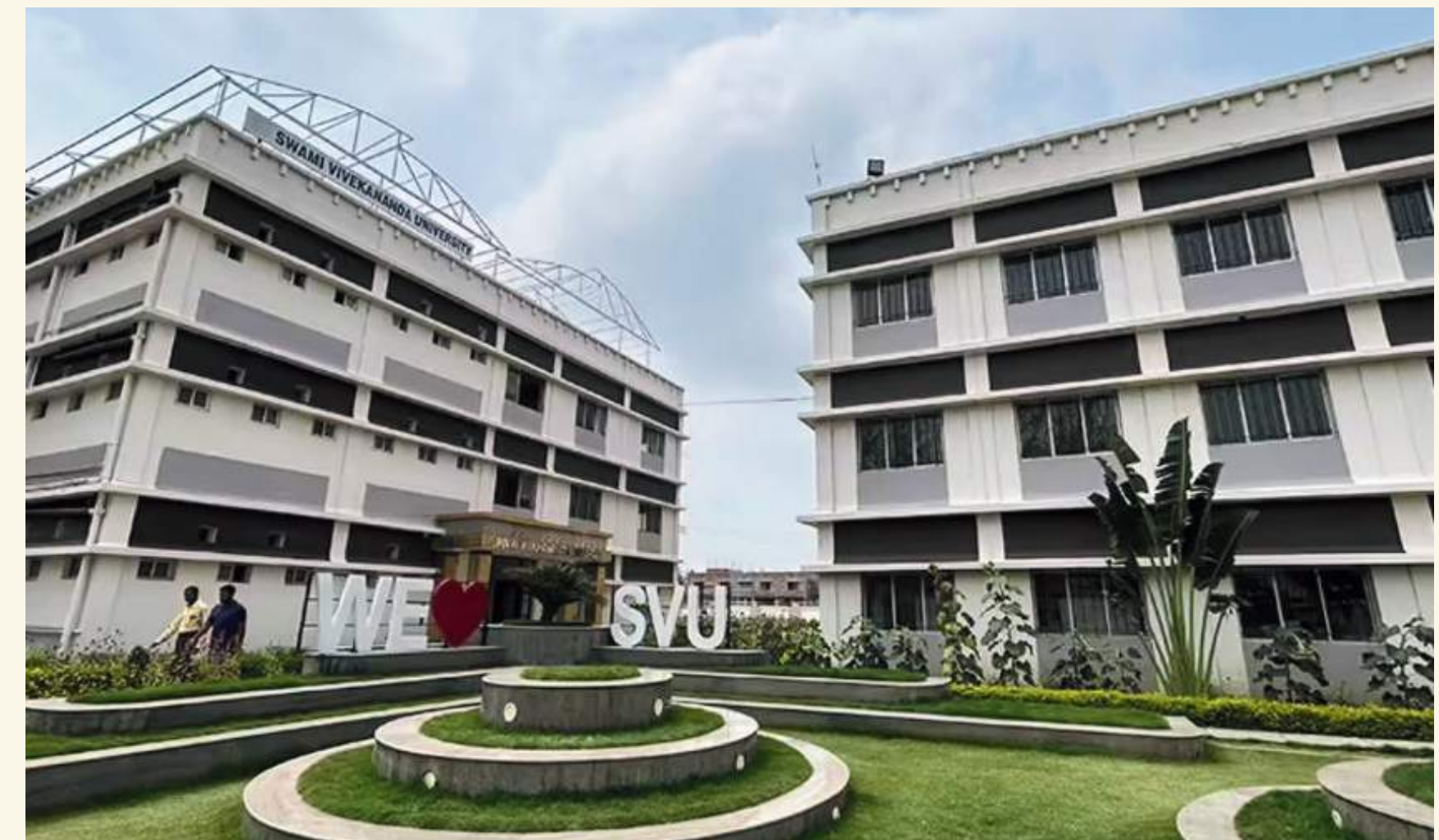
Swami Vivekananda University

Approved By AICTE & Affiliated To, WB-SCTVESD