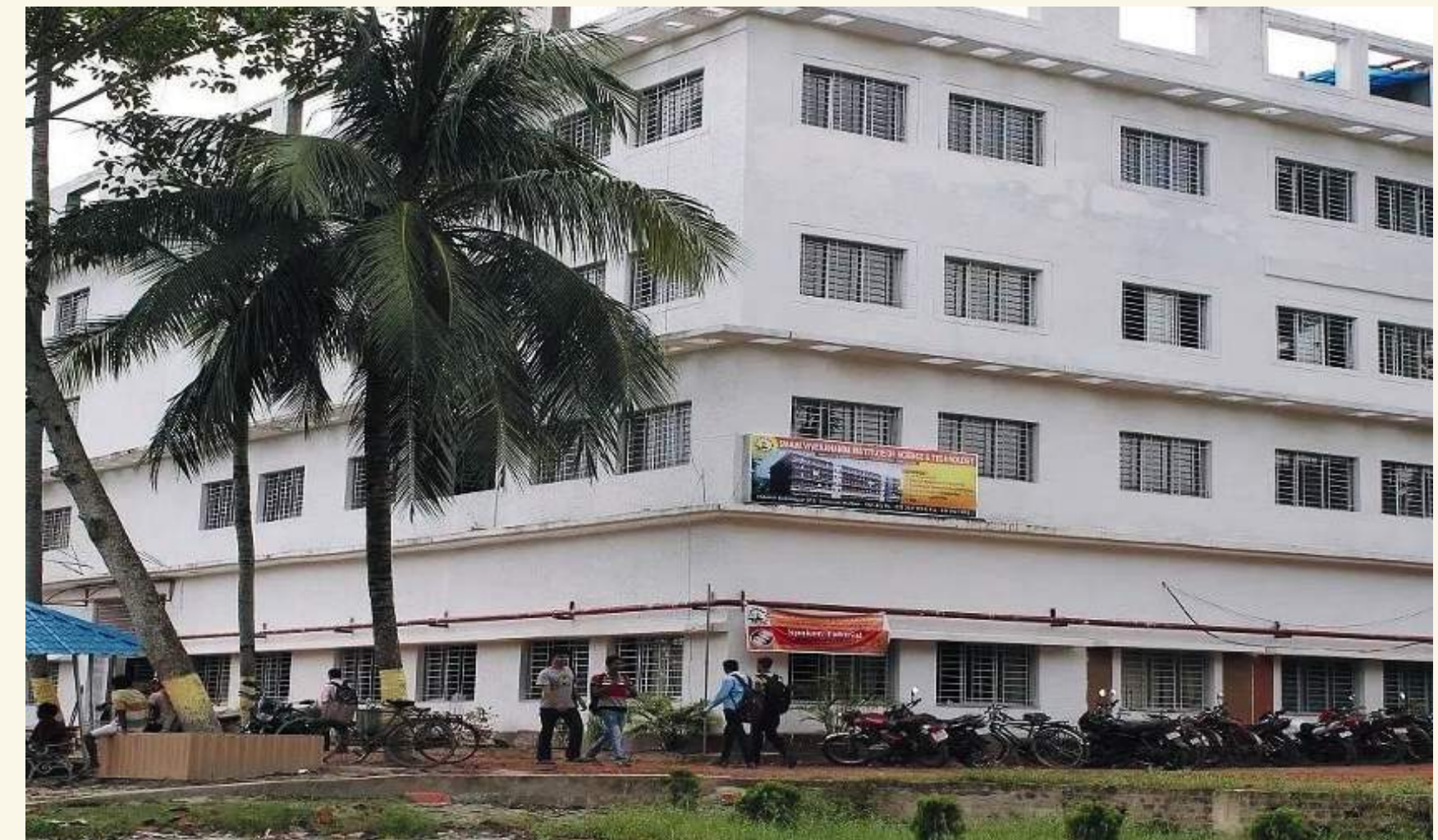
Swami Vivekananda Institute Of Science And Technology

Approved By AICTE & Affiliated To MAKAUT