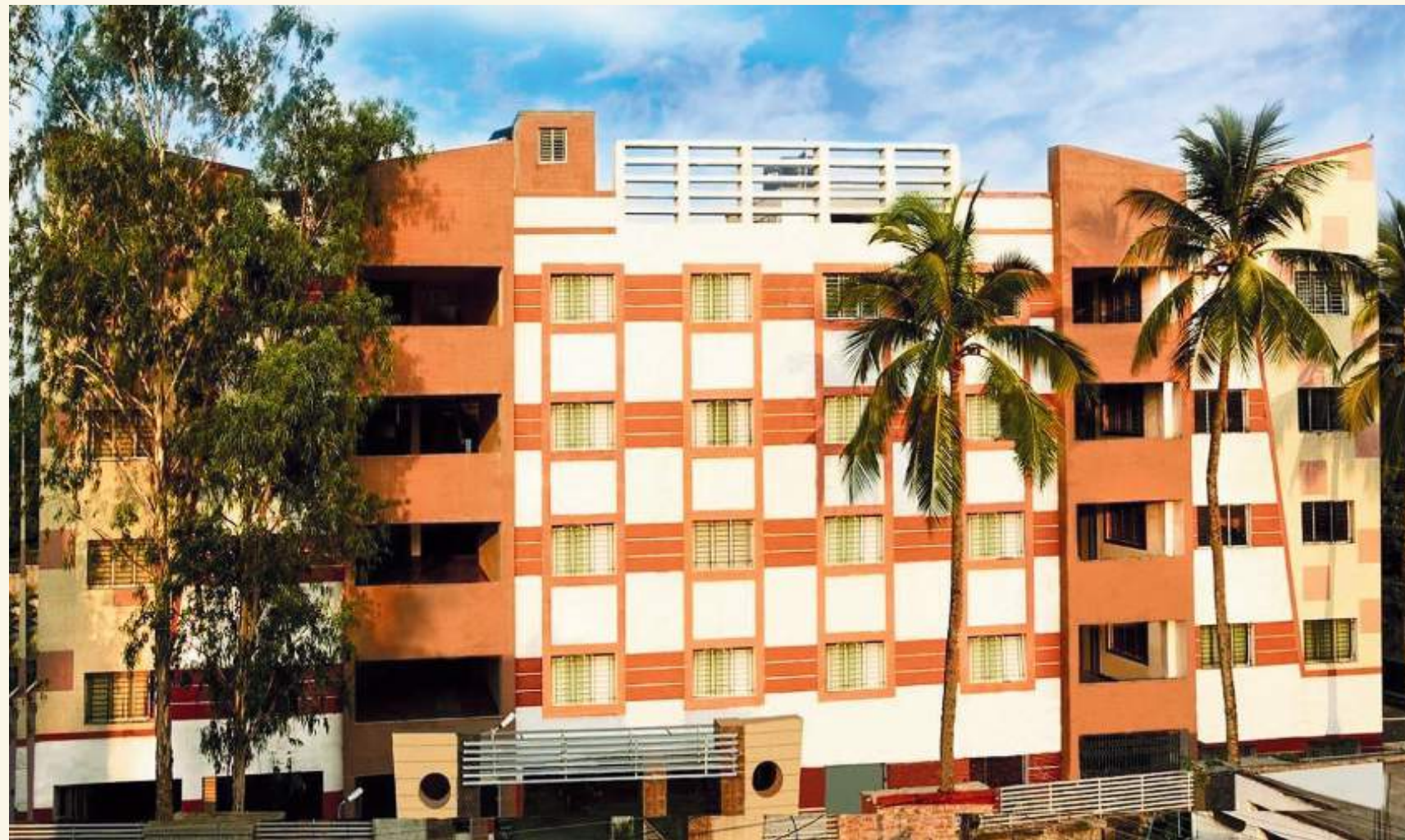
Swami Vivekananda Institute Of Modern Science

Approved By AICTE & Affiliated To MAKAUT