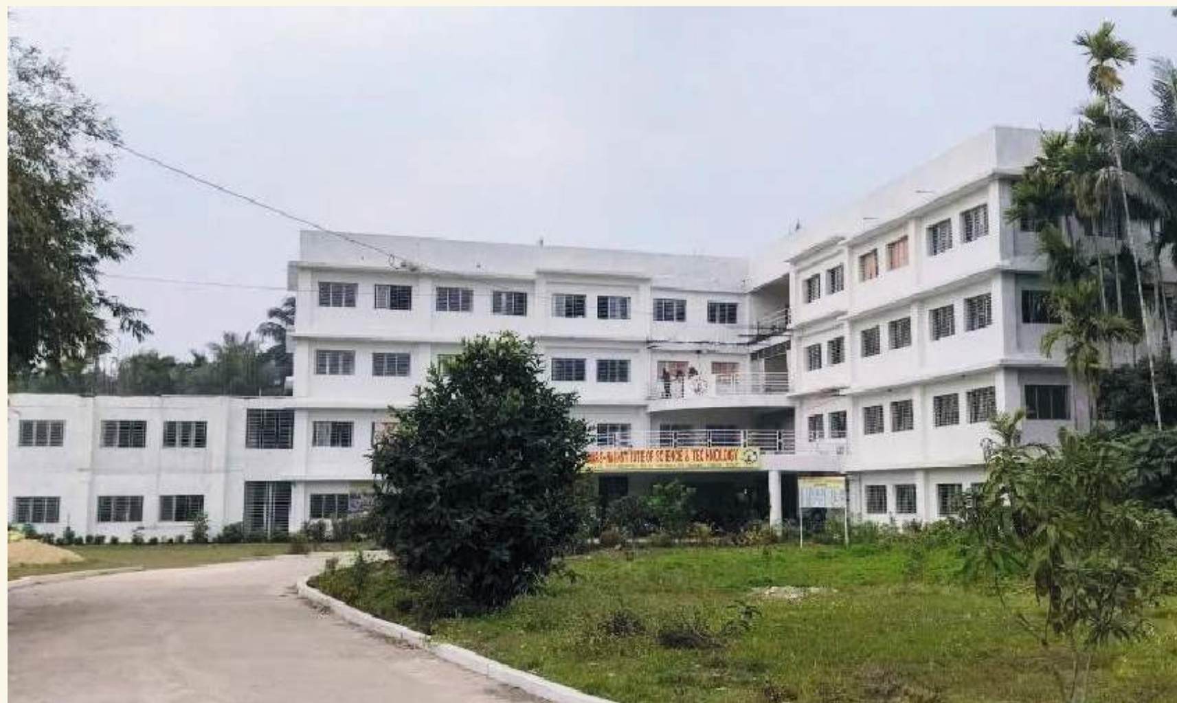
Shree Ramkrishna Institute Of Science And Technology

Approved By AICTE & Affiliated To MAKAUT, NAAC