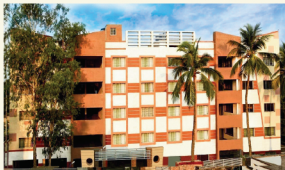
Swami Vivekananda Institute Of Modern Science

Approved By AICTE & Affiliated To MAKAUT