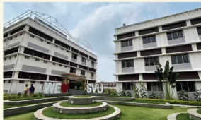
Swami Vivekananda University

Approved By AICTE & Affiliated To, WB-SCTVESD