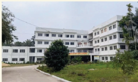
Shree Ramkrishna Institute Of Science And Technology

Approved By AICTE & Affiliated To MAKAUT, NAAC