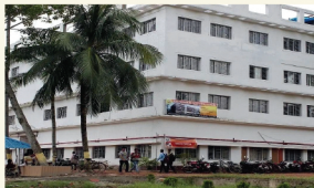
Swami Vivekananda Institute Of Science And Technology

Approved By AICTE & Affiliated To MAKAUT